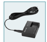
Charger kit K-BC63E