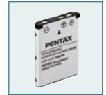
Li-Ion battery D-LI63