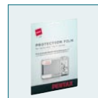
LCD protection foil