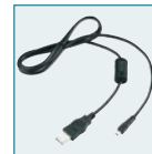
USB cable I-USB7