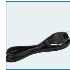
AC cable D-CO24E