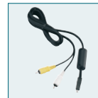
AV cable I-AVC7