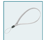
Hand strap O-ST20