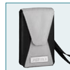
Nylon case NC-M1