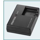
Battery charger D-BC63