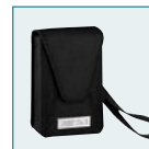
Nylon case NC-E1