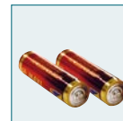
2x AA batteries