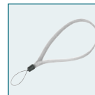
Hand strap O-ST62