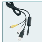
USB/AV Cable I-UAV62