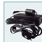
AC Mains Adapter Kit K-AC62E