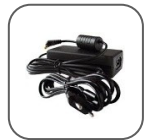
AC adapter kit