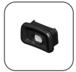
Magnifying Eye cup