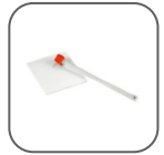
Sensor cleaning kit