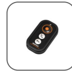
WP remote control